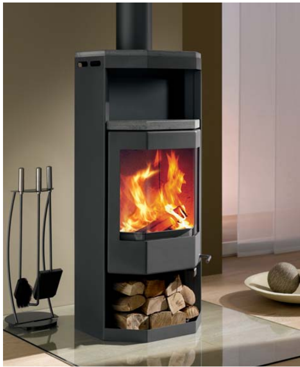
Steel version with top plate and pot warmer made from soapstone